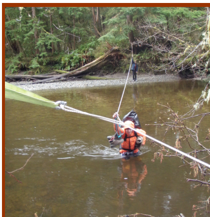
-Goodman Creek Crossing-

We again rendezvoused the final night for smores' by the campfire and a time to exchange stories from the trail. Each night we talked about the importance of good fellowship, teamwork, leadership, and how the Bible is a great guide to progress in these areas. The growth that emerged from these high school students over the course of the week was beautiful and obvious.